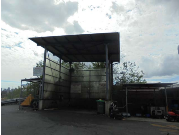
Photo 1. No hazardous materials suspected or identified at the time of assessment.